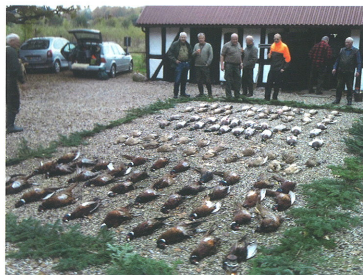
Picture 3. My Sauer & Sohn (proof 1915) with a Danish Ringneck Anno 2016.