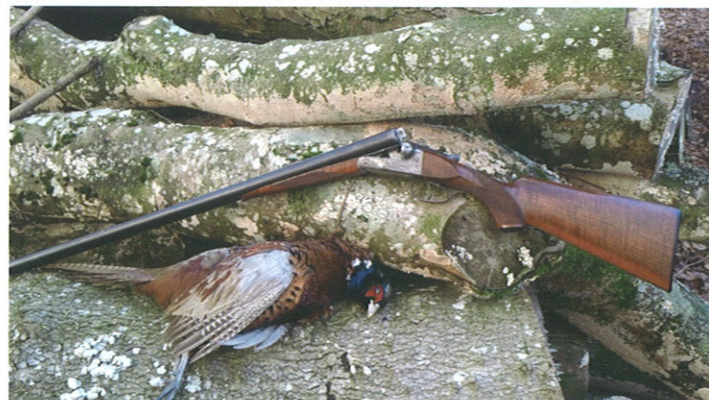
Picture 4. Peter has published a book about Chr. Funk's weapons and history. An outstanding book that should be found in all gun collectors' bookshelves. It consists of 180 pages in English / German languages. It can be ordered on our website: Germanguns.com Europeans can order via germanguns.eu@.com